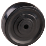
聚乙烯輪 PVC on PP Core