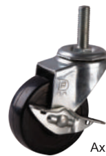
軸剎 Axle Lock Brake