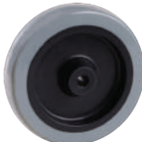
超級人造膠 TPR on PP Core