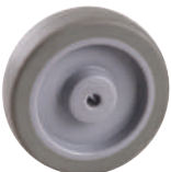
高科技耐磨聚氨酯 PU on PP Core