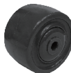
King Kong Wheel

*Other Anti-Static Wheels Available, Please Contact The Factory