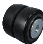
QPU(Dual Anti-Static Wheels)