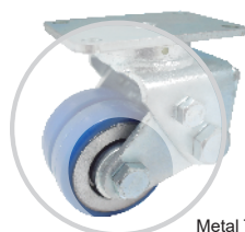
Metal Thread Guard(optional)